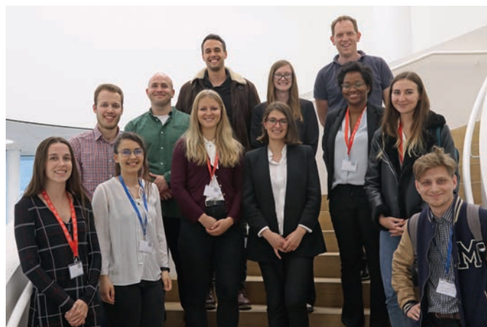
Host and visitors